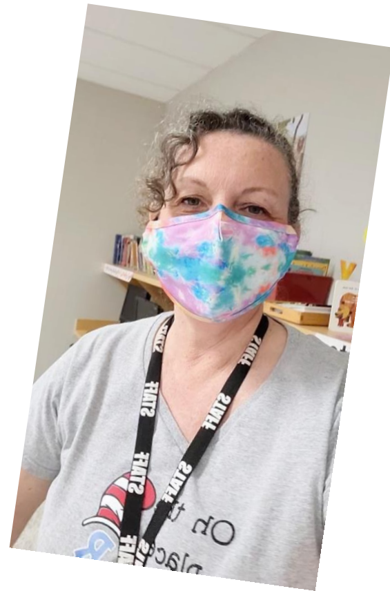
Video from kindergarten. Click the picture to play.

IF YOU WOULD LIKE TO SUPPORT ST. PETER CATHOLIC SCHOOL WITH A DONATION THAT MAKES A DIFFERENCE IN THE EDUCATION OF OUR STUDENTS, PLEASE CONTACT LEAH MILES AT LMILES@STPETER-DELAND.ORG .