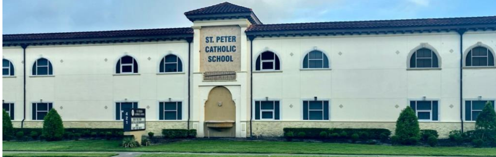
ST. PETER CATHOLIC SCHOOL

The mission of St Peter Catholic School is to form disciples, rooted in the teaching of the Catholic faith through a curriculum of academic excellence within a safe, caring environment.