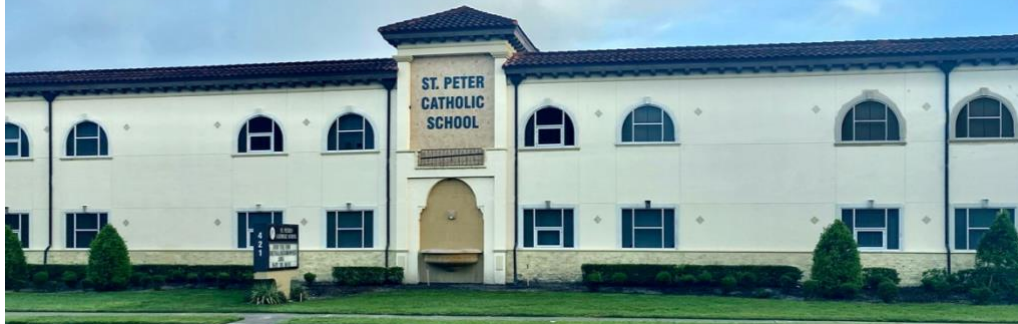
ST. PETER CATHOLIC SCHOOL

The mission of St Peter Catholic School is to form disciples, rooted in the teaching of the Catholic faith through a curriculum of academic excellence within a safe, caring environment.